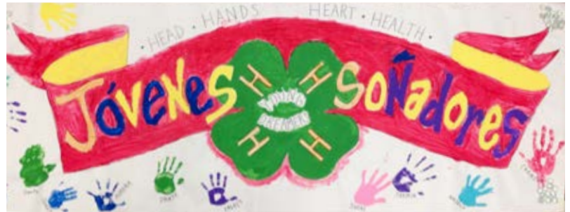
A poster designed and hand painted by Latino youth displaying "Jóvenes Soñadores (Young Dreamers)" the name they chose for their 4-H club.